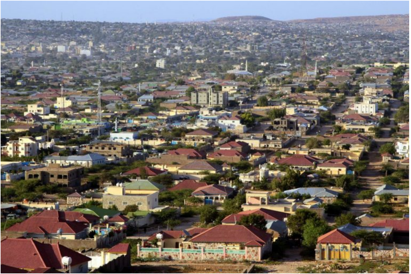
Hargeisa, the capital of Somaliland