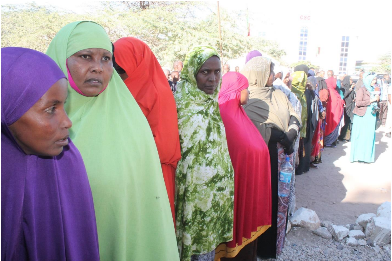
Photo: Women queuing to cast their votes in November 2017 presidential election